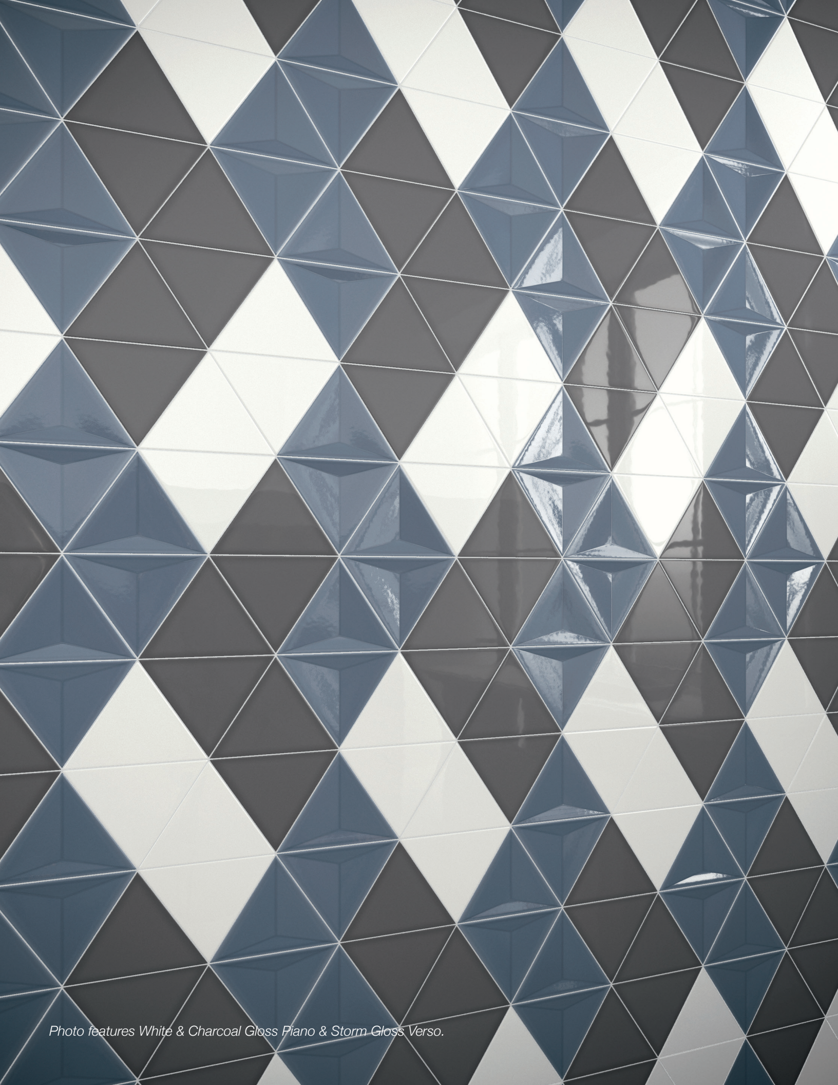
Photo features White & Charcoal Gloss Piano & Storm Gloss Verso.