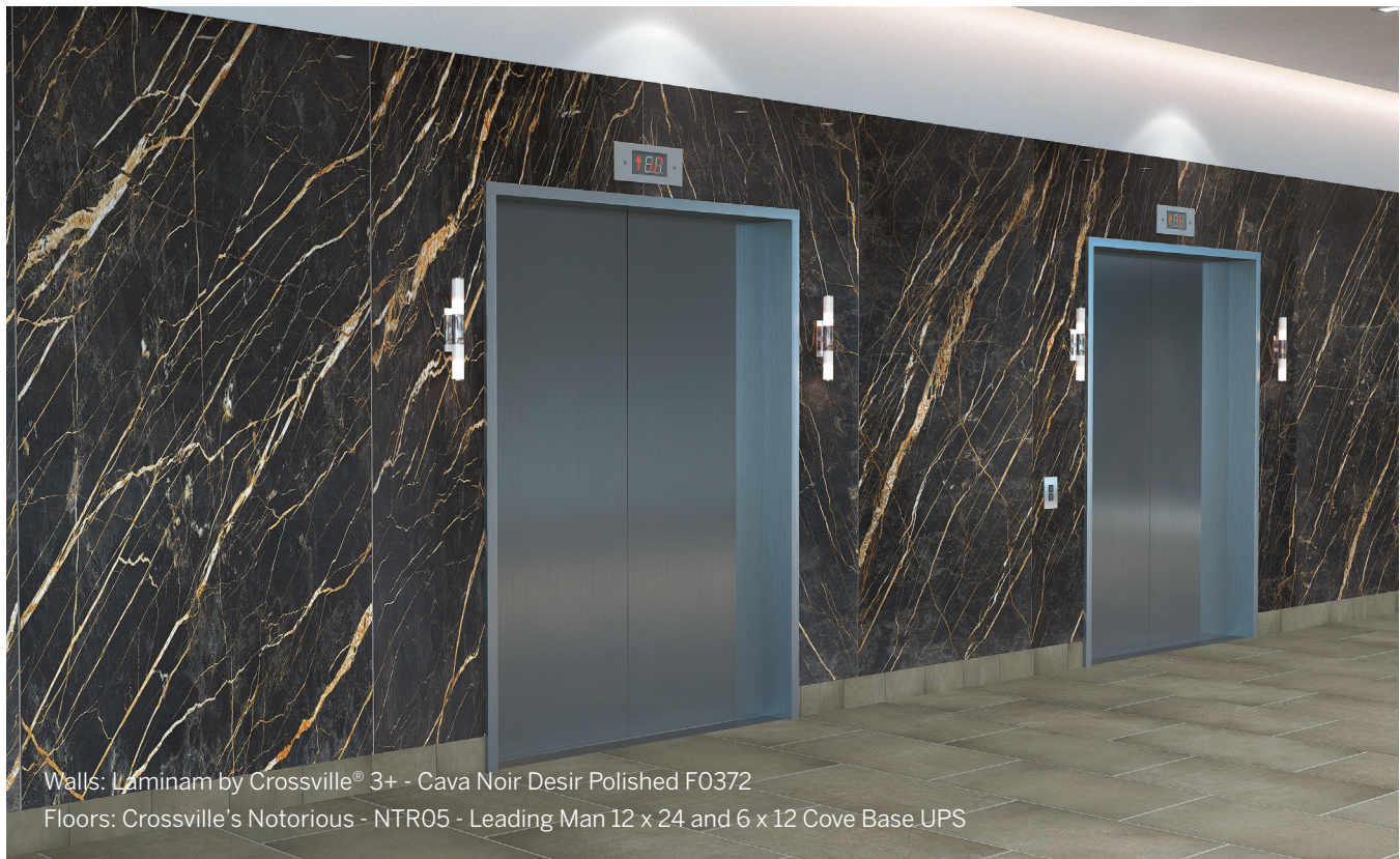
Walls: Laminam by Crossville® 3+ - Cava Noir Desir Polished F0372

Please Note: Due to DCOF value, these tile panels are not recommended for applications in wet areas or areas where standing water may occur.