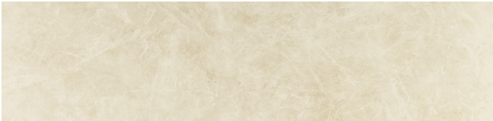
Diamond Cream Bush Hammered - F7049 - 5.6 (Floors & Walls) - Stocking