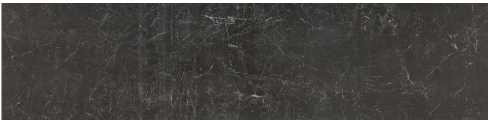
Nero Greco Polished** - F0373 - 5.6 (Walls) - Stocking

Note! These samples depict base color and sheen. Please refer to our website for a more accurate depiction of veining and pattern. *See chart on the next page for further information