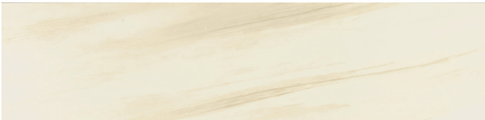
Bianco Lasa Bush Hammered - F7048 - 5.6 (Floors & Walls) - Stocking